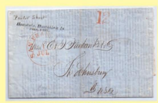
Honolulu Straight Line Cancel