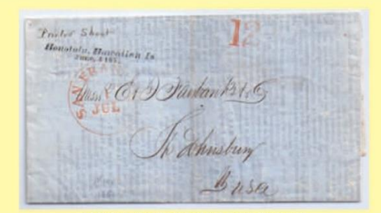
Honolulu Straight Line Cancel