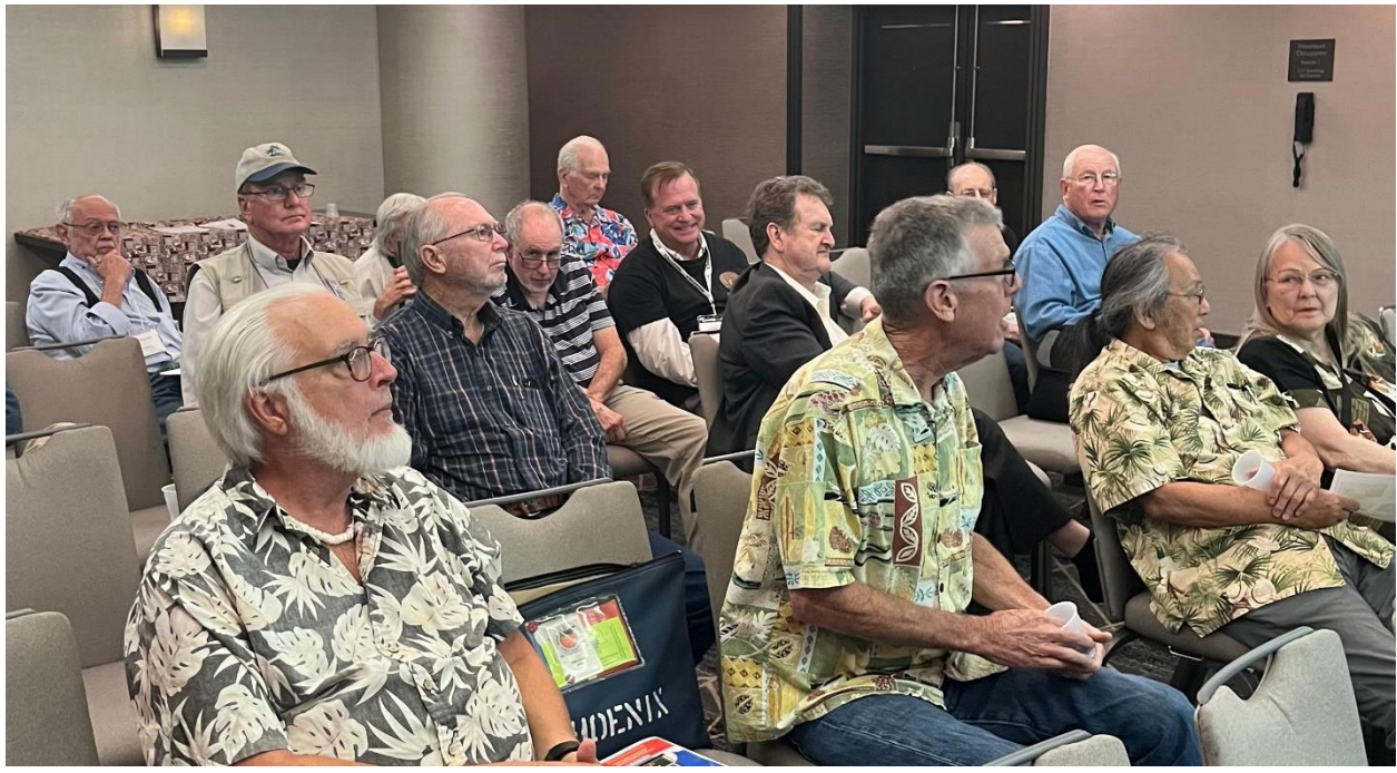
Attendees of the "Meet & Greet" at WESTPEX 2023